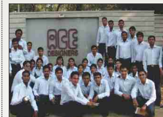
Industrial tour of MBA students to ACE Designers, Bangluru in 2010