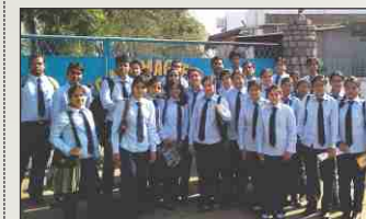
Industrial tour of MBA students to East Coast Magnets Ltd., Hyderabad in 2012