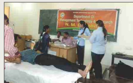
Blood Donation Camp Organized at Dept. of Management Technology & Research on Teachers' Day 2013