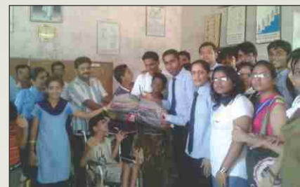
MBA students donating Material to the Kids of Physically Challenged School, Gondia on Teachers Day 2013