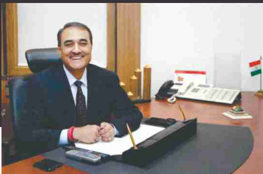
Patron Hon'ble Shri Praful Patel