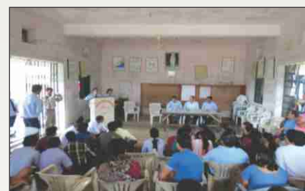
MBA Students celebrating 'Teachers Day-12' with kids of school for physically challenged