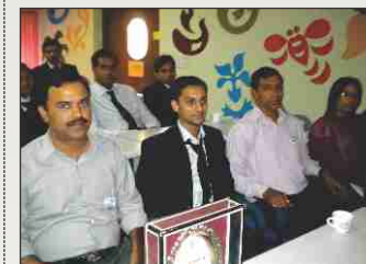
Industrial tour of MBA students to H.L.L., Chhindwada in 2011